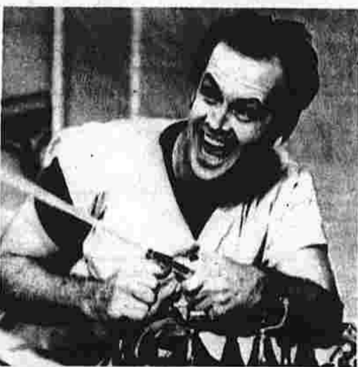
Jack Nicholson sprays water in a scene from "One Flew Over the Cuckoo's Nest," which leads the 48th annual Oscar nominations.

Best director—Milo Forman, "One Flew Over the Cuckoo's Nest," Federico Fellini, "Amarcord," Stanley Kubrick, "Barry Lyndon," Sidney Lumet, "Dog Day Afternoon," and Robert Altman, "Nashville."