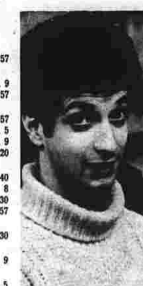
Ron Palillo plays Arnold Horshack in ABC-TV's "Welcome Back, Kotter," Thursdays at 8 p.m.