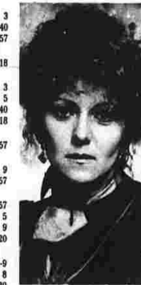
Brenda Vaccaro plays a frontier schoolteacher in CBS-TV's "Sara," Fridays at 8 p.m.