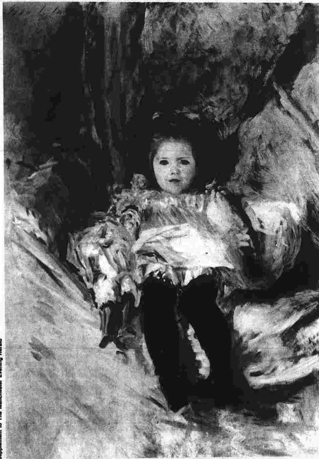
Supplement to The Manchester Evening Herald